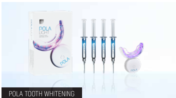
POLA TOOTH WHITENING